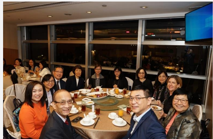
3. AGM dinner