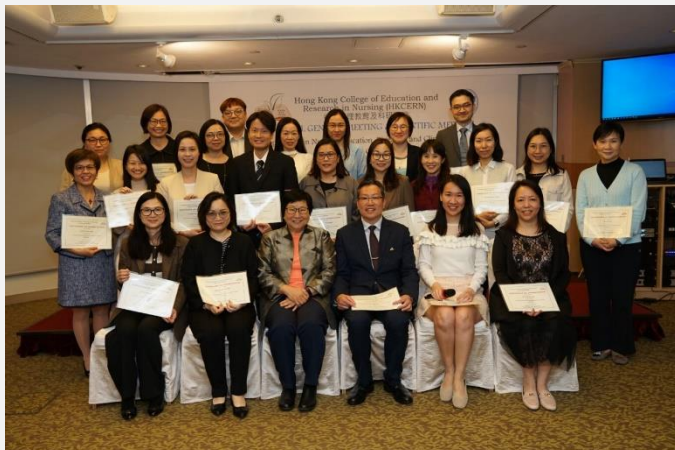
2. New HKCERN Council Members 2024-2027